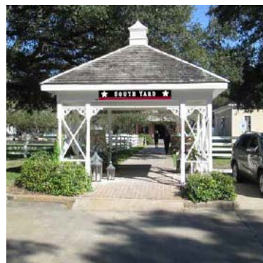
Park near the gazebo.

As you drive in, you will see this sign. Turn right and the South Yard/Lodge Hall will be on your right.